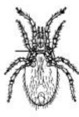
Ornithonyssus sylviarum Northern Fowl Mite