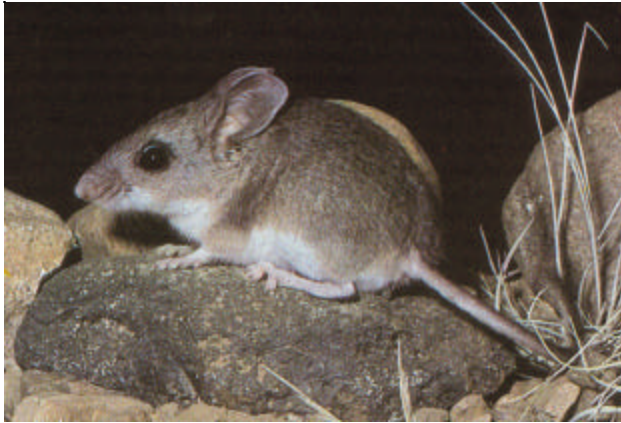
DEER MICE Peromyscus maniculatus

The hantavirus associated with deer mice (Sin Nombre Virus) causes a severe disease in humans (Hantavirus Pulmonary Syndrome - HPS). HPS has been confirmed in all the southwestern states including California. Studies in Orange County have identified Sin Nombre Virus (SNV) in deer mice, other related rodent species, and woodrats.