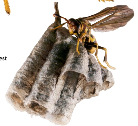
Adult Paper Wasp on a Nest