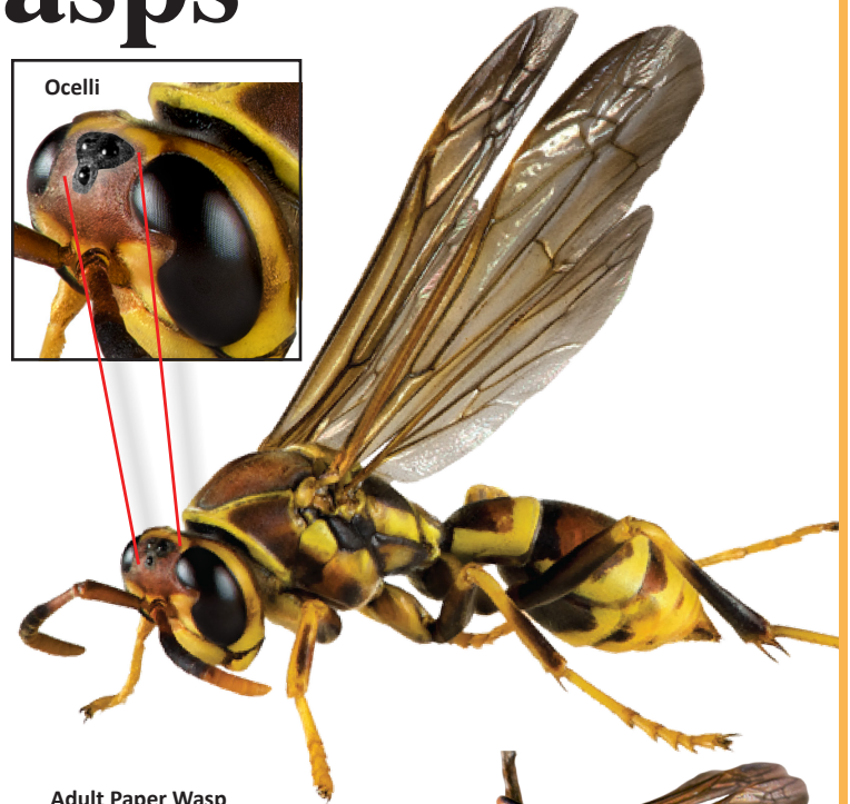
Adult Paper Wasp