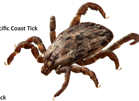
Pacific Coast Tick